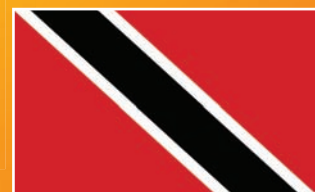
Trinidad & Tobago