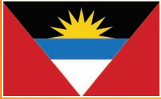
Antigua & Barbuda

Caribbean Life reaches a broad cross-section of West Indians living in New York and its suburbs. In addition to a large readership among Jamaicans, Trinidadians, and Guyanese, Caribbean life also draws readers from St. Lucia, Grenada, Haiti, St. Vincent & The Grenadines, and African-Americans.*